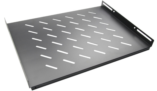
Image of WPR45FS, WPR60FS is the same but only differs in depth.

A 19" Fixed shelf made of steel with a plate thickness of 1,2 mm and provided with a black (RAL9004) structured powder coating. The shelf can be used to store equipment which doesn't contain a standard 19" mounting fixture. For use WPR racks only.