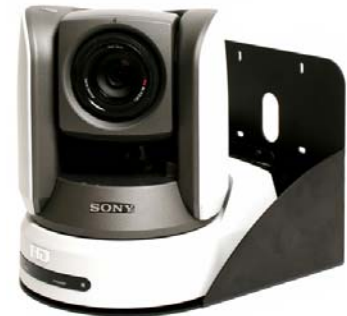
Figure 2: BRC-Z700 on 535-2000-225 Mount