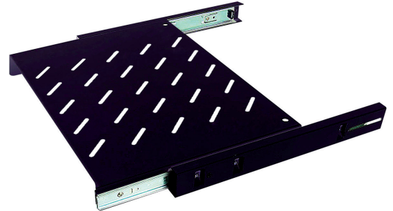
Image of SPR60SS, SPR80SS is the same but only differs in depth.

A 19" Sliding shelf made of steel with a plate thickness of 1,2 mm and provided with a black (RAL9004) structured powder coating. The shelf can be used to store equipment which doesn't contain a standard 19" mounting fixture or equipment that needs to be accessed frequently. The smooth sliding shelf provides easy access. For use with SPR racks only.