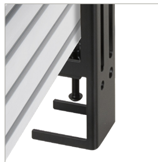
Safety screws help prevent unauthorised removal of the screen