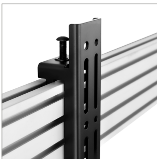
Simple 'hook-on' installation