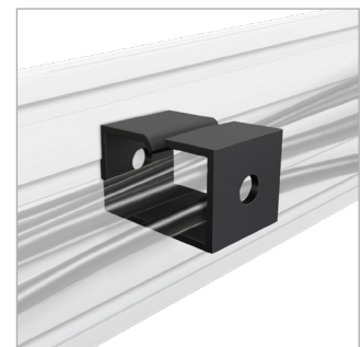
Cable management clips (BT8390-CMC) are included to keep the install tidy