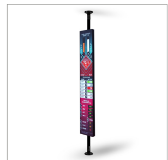
Pole mounted options are also available using System 2 poles, collars and ceiling & floor mounts