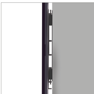
Mounts the screen 65mm from the wall, allowing easy access to connectors