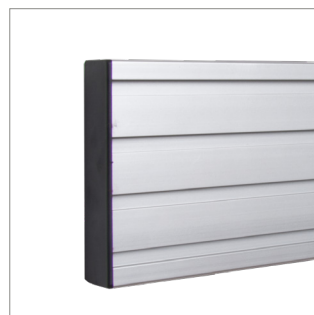
High-end aesthetic quality with stylish end caps for a neat and tidy install