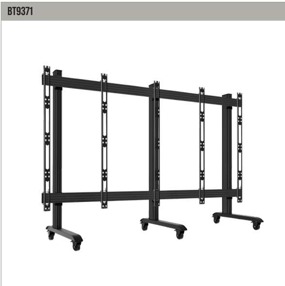
MOBILE UNIVERSAL DIRECT VIEW LED VIDEOWALL STAND