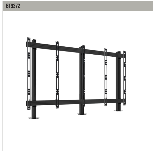
BOLT DOWN UNIVERSAL DIRECT VIEW LED VIDEOWALL STAND