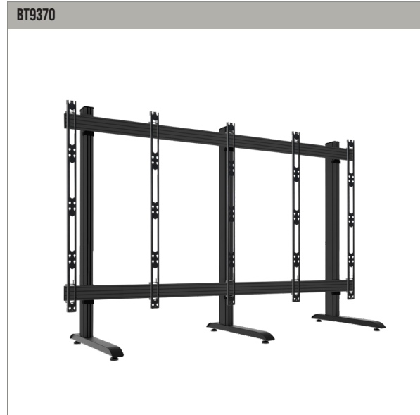
FREESTANDING UNIVERSAL DIRECT VIEW LED VIDEOWALL STAND