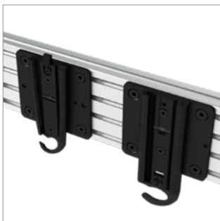
Allows a range of flat screen wall mounts to fit onto System X rails