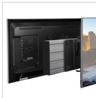
Ideal for creating back-to-back desktop mounting solutions