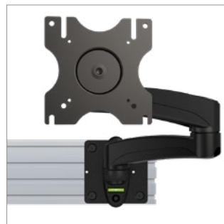
Allows BT7399 Desk Mount Adaptor to fit B-Tech desk mounts onto System X rails