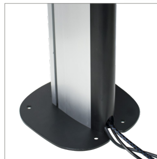
Integrated cable management for a neat and tidy installation