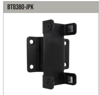
Joining Plate Kit is used for joining Mounting Rails to Vertical Columns