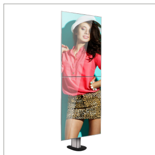
Can be used for single column installations in landscape or portrait format