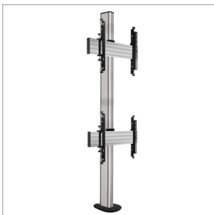
Must be used with System X mounting solutions using BT8380 vertical columns