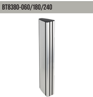
Vertical Support Columns for freestanding, mobile or bolt-down screen mounting