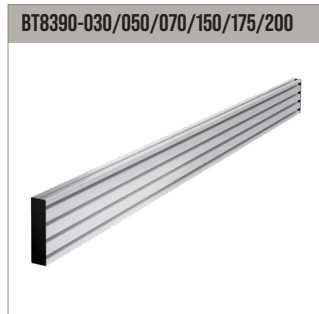
Mounting Rails can be fixed to columns, walls or poles using System X components