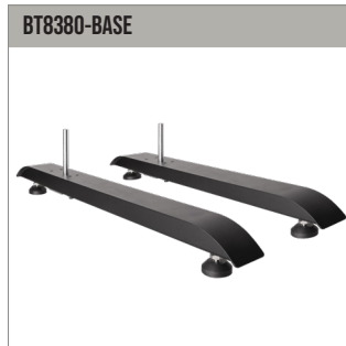
Floor Bases attach directly to Vertical Columns to create a secure foundation for freestanding or mobile mounting solutions