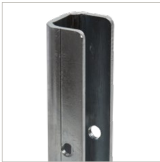
One-piece design for a quick install