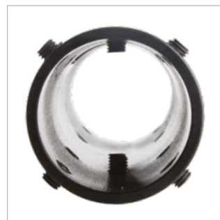
Supplied with optional short safety bolts to allow cables to pass through