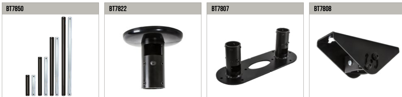
BT7850 Ø50mm Poles up to 3m in length