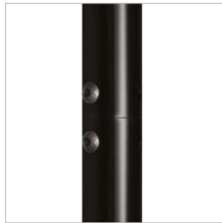
Creates a seamless pole join