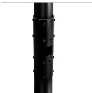
Grub screws which allow micro-adjustment of pole angle