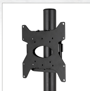
Fit B-Tech screen mounts to the pole using a BT7052 or a BT7841 collar