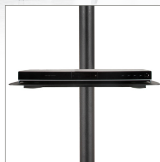
B-Tech AV shelves and accessories can also be fitted to the pole using BT7052 or a BT7841 collars